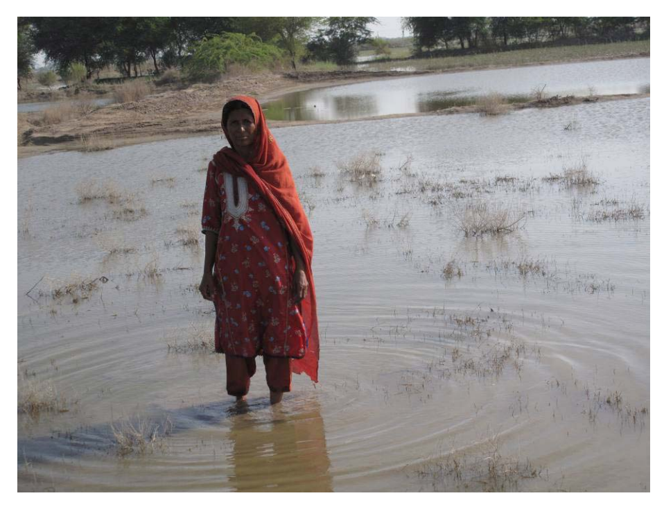
A farmer from Thatta standing in her flooded field.

The monsoon floods that began in Pakistan in July 2010 caused a colossal disaster. Thanks to the collective efforts of the Pakistani Government, UN agencies, international NGOs, and local relief organisations, the response has achieved major successes and seen millions of Pakistanis receive vital emergency relief. However, the disaster is not over and many people still need humanitarian assistance. Ongoing emergency relief is just the first step in rebuilding devastated communities. A nationally led, pro-poor reconstruction programme is needed now to create a path of sustainable development leading to a fairer and more disaster-resilient Pakistan.